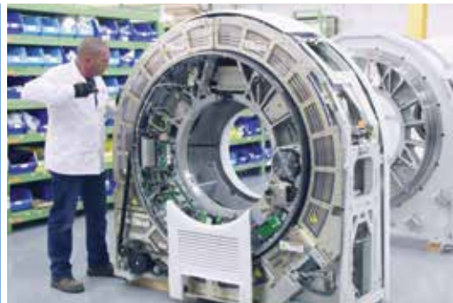
Medical & Industrial