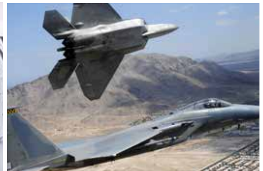
Defense & Aerospace